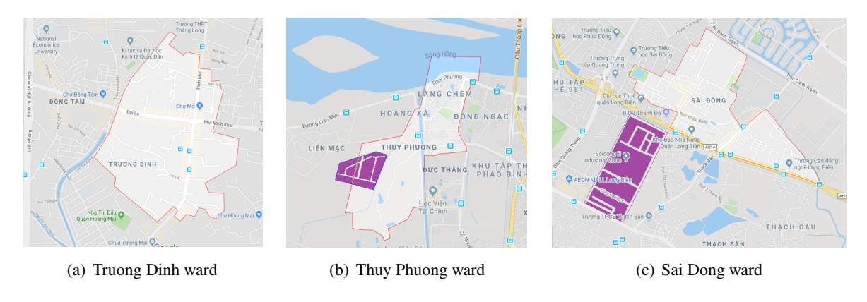
Figure 1. Maps of research areas (Red boundary areas: wards; purple areas: IZs)

This research forms part of a larger-scale project on migrant workers administered by TRYS-PACES – an international research organisation focusing on transformative youth spaces. Subjects of research are young migrant workers between the ages of 16 to 29. The sites of project are 5 wards, in which three wards are the areas of migrant workers namely Truong Dinh, Thuy Phuong and Sai Dong (Fig. 1). The survey was conducted from September till the end of December 2018.